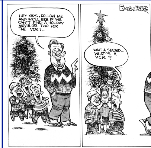
Fig. 4: University of Windsor Leddy Library Archives & Special Collections, F 0153 (Mike Graston fonds), item #1217, "What's a VCR?" - Kids," December 28, 2004.