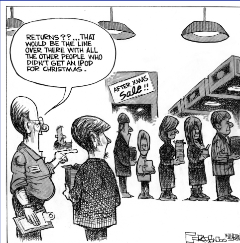
Fig. 5: University of Windsor Leddy Library Archives & Special Collections, F 0153 (Mike Graston fonds), item #1216, "Boxing Day Returns" - iPod Craze," December 27, 2004.